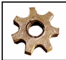
Figure 1 An idler with corrosive wear

The effects of moving both corrosives and abrasives are similar -- pumps wear more quickly. Both corrosion and abrasion remove some material from the pump parts, however, evidence of corrosion is different from indicators of abrasion. Corroded parts show even wear and possibly some pitting (Figure 1). Abrasion, however, causes uneven wear that follows the mechanics of the pump. On the outside diameter of a gear, for example, wear causes a scoring along the path of rotation (Figure 2).