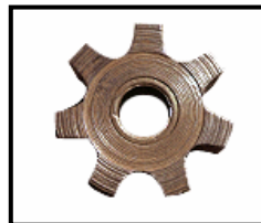
Figure 2 An idler with wear from large abrasive particulate

Typical corrosive applications can be found in almost every industry, but they are particularly common in the chemical and paper industries.